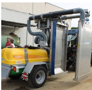
Figure 1. Trained air blast single-row tunnel sprayer built by Maggio Company

The trained air-blast tunnel sprayer (Figure 1), manufactured by the Company Maggio with the collaboration of the DiSAAT, is specifically designed for pesticide application in espalier vineyards of the Salento. The machine is built by adopting a galvanized steel frame on which the following elements are arranged: the 1000 L tank for the mixture; the axial fan; the pump unit with its connections; valves to control and limit pressure and to control flow volume; positional hydraulic and mechanical servo-mechanisms for the motion of the shields; the piping for conveying the air flow produced by the fan to the two shields of the tunnel. One of the shield of the tunnel is rigidly connected to the frame, while the other one can slide horizontally, allowing adjustment of the distance between the shields. The machine is equipped with sensors connected to the control unit, so allowing to evaluate in real time the operating parameters: nozzle flow rate, operating pressure, sprayer velocity, volume rate.