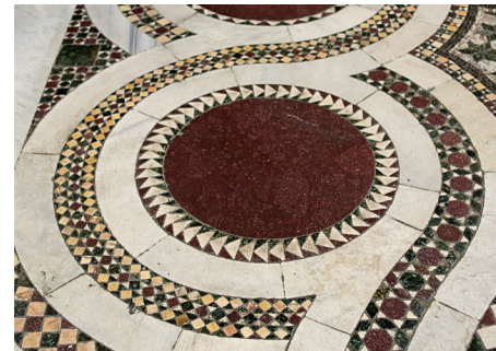
Detail of Cosmatesque floor, Basilica di Santa Maria Maggiore, Rome