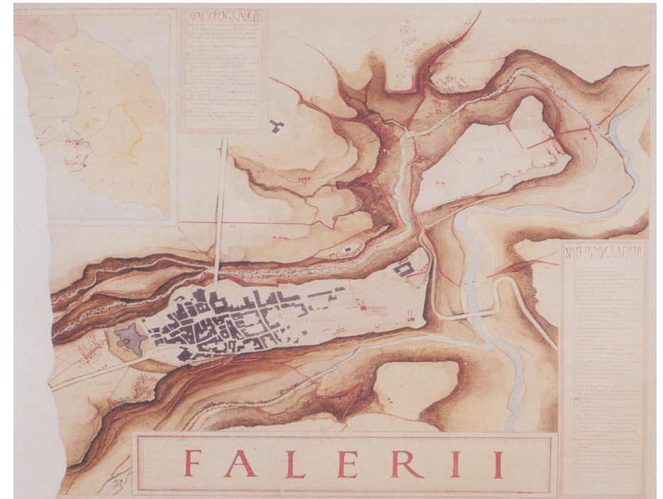
Falerii (A. Cozza, Museo Nazionale Etrusco di Villa Giulia)