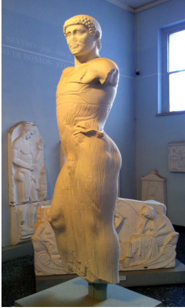
Motya charioteer replica (L. Nigro)

Motya at the centre of the 'Middle Sea': new insights and new approaches Lorenzo Nigro (Sapienza)