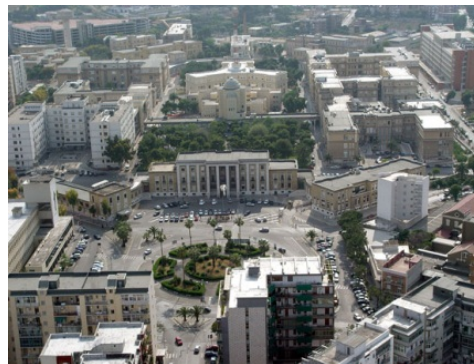
The Policlinico Hospital, Piazza G. Cesare