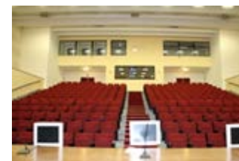
The Aula Magna "G. De Benedictis" Medical School