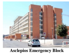
Asclepius Emergency Block