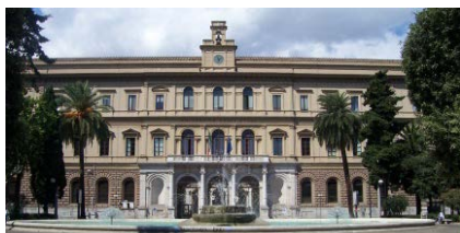
The Atheneum in Piazza Umberto

The University's facilities include central and departmental libraries, theatres, lecture halls, job placement centres, a press office, counselling centres, and chapels. These facilities are open to students and staff members, and can be used free of charge. Each year, the University sponsors various cultural activities to foster exchanges among local and international students. The Erasmus+ programme is very active in the Medical field (code Bari01).