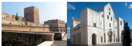
Swabian Castle & Basilique of S. Nicholas

The course is similar to the standard Italian medical curriculum in Bari. Teaching will consist of lectures, patient demonstrations, clinical skills, seminars, distance learning, self-study, and special sessions with foreign teachers belonging to a Network for Excellence in Medical Education. The strength of BEMC is based on small classes, all courses taught in English, excellent mix of theory and practice, international environment, and global Campus network.